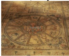
Zodiac Mosaic from a Synagogue

The disciples had gone on a mission, healed the sick, cast out demons and instead of firm confidence in Jesus' control they feared dead people. They also believed in the Zodiac. The recesses of the human soul look to stars, fear the dead, try to appease them, contact them or get them to help. People say about the dead, "My guardian angel looks down on me." If one who died is in heaven, they're up looking at Jesus, not down at us. If not in Jesus, their problems are worse than yours and mine. But the occult was so deep in their culture many were demon possessed. All of those demon possessed people Jesus set free just didn't pick their demons going to the corner store for loaves and fishes. They participated in secret and occultic things, probably not to do evil but to get some kind of supernatural help for their daily lives. They were a gentile influenced culture in Galilee, it was called, "Galilee of the Gentiles" (Matthew 9:1). They wandered from dependence upon God, and saw the spirits as available and then when it was too late, they were slaves of the dark spirits.