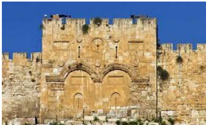
East Gate of Jerusalem filled in by Suleiman the Great to prevent Messiah from entering

The hope of Nehemiah and the Jewish people of His time was to have their city back, that it'd be a safe place, that they'd finally be safe as they rebuilt. We're going to look at the East Gate, the gate that was rebuilt that had very special significance. The East Gate today, is on top of the old East Gate that was at Nehemiah's time. The East Gate is prophesied to be the Messiah's gate. Ezekiel 46:12 prophesied that the Messiah would enter through there.